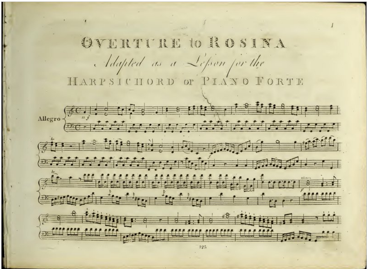
William Shield, Overture to Rosina (keyboard reduction) ( IMSLP )

The overture to Rosina by William Shield (1748–1829), first performed at Covent Garden in 1782.