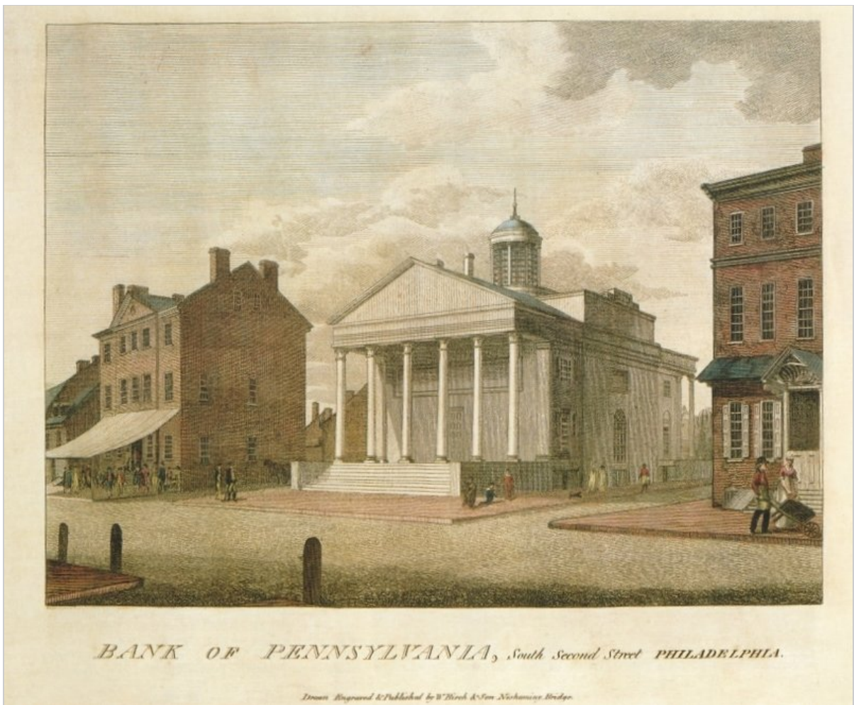
City Tavern (left) and Bank of Pennsylvania, Birch's Views of Philadelphia , 1800

Concerts were held in the "Long Room," which stretched across the full width of the second floor and measured 48 x 21 feet, thus about 1000 square feet, with the possibility of extra space for overflow crowds in smaller rooms at the back of the building. The "new orchestra" mentioned in the advertisement was a moveable raised platform that could be installed when needed at one end of the room (Murray 1994, 17); the construction of fixed stages had been made subject to penalty by act of the Pennsylvania Assembly in 1779, in an (ultimately vain) attempt to discourage theater, considered morally suspect (Potter 2011, 30).