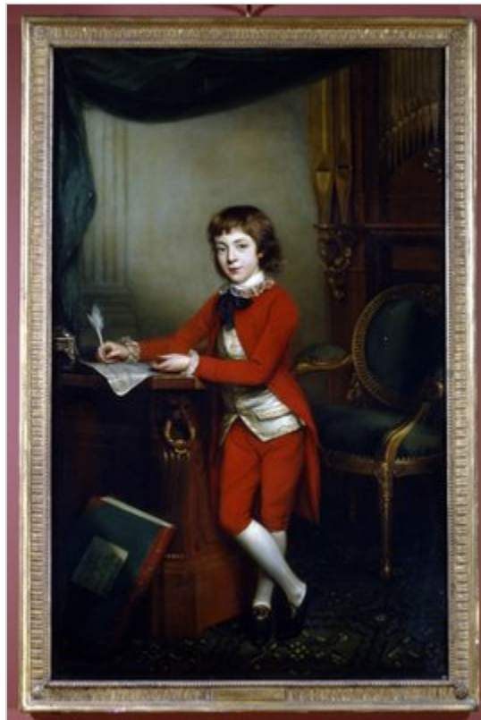
John Russell, Samuel Wesley as a Child, Composing , 1777. Museum of the Royal Academy of Music ( accession no. 2003.1046 )

Mozart's only other publications that might have found their way to London by 1774 were the variations K. 24 and K. 25, and the sonatas K. 26–31, all published in The Hague and Amsterdam in the spring of 1766. It seems unlikely that Mozart's songs, K. 52 and 53, published in Gräffer's Neue Sammlung zum Vergnügen und Unterricht in Vienna in 1768, would have been available in London. Mozart published nothing else until 1778 (the question of the possible manuscript circulation of Mozart's music in Britain prior to 1775 seems to have been little studied). No music by Mozart is known to have been performed in London between 1765 and 1784 (see Cowgill 2000, Appendix F, here esp. 292). All in all, then, it seems most likely that in 1774 Samuel Wesley would still have been shown Mozart's earliest publications from 1764 and 1765, when Wolfgang was eight and nine years old. That Samuel himself was eight at the time of his condescending judgment makes the anecdote all the more amusing.