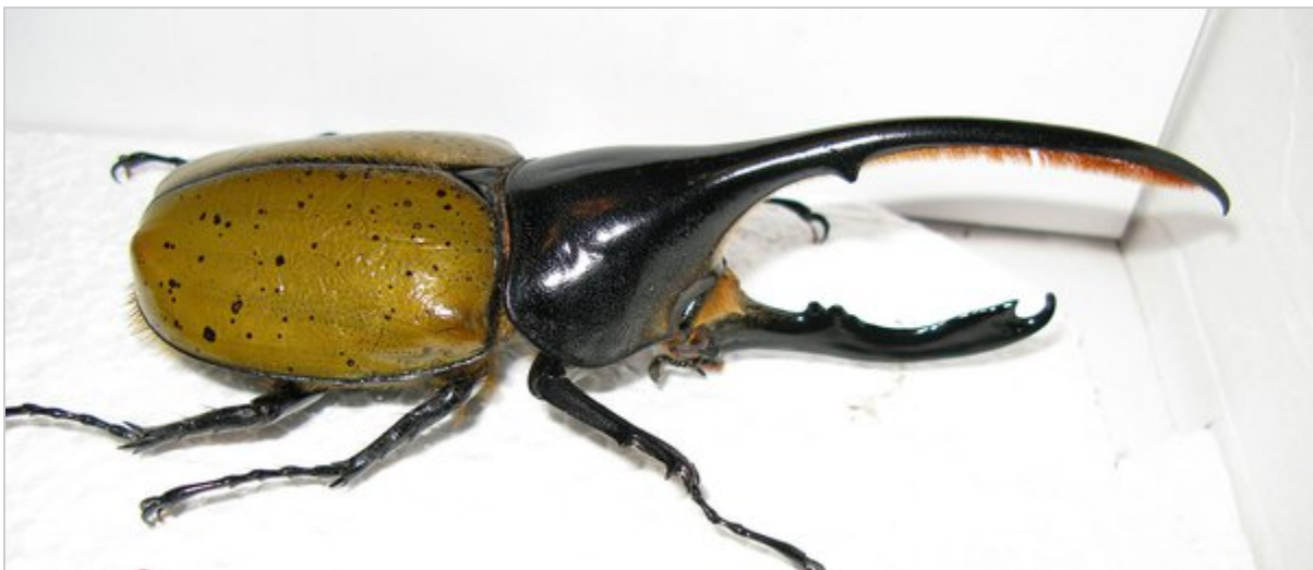
Male Hercules beetle ( Dynastes hercules lichyi  )