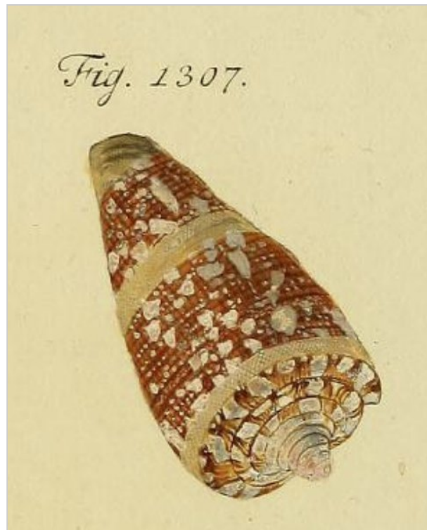
Martini, et al., Neues systematisches Conchylien-Cabinet , X, fig. 1307