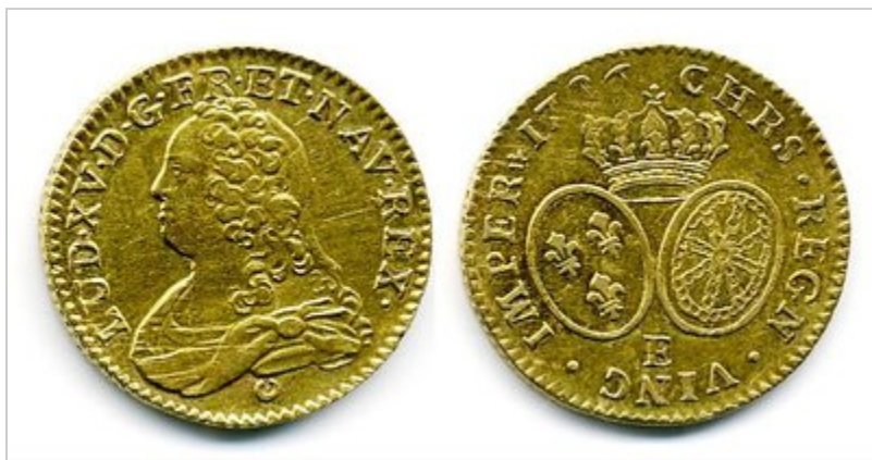
A Louis d'or with the image of Louis XV

The Louis d'or was a gold coin, first introduced by Louis XIII in 1640, with a profile of the king on one side and a royal coat of arms on the other. Louis d'or were subsequently minted with the profiles and arms of the next three kings: Louis XIV, Louis XV, and Louis XVI. In 1726 the value of the Louis d'or was fixed at 20 livres, revalued in 1740 to 24 livres, where it remained at the time of the Mozarts' visit. Thus the 1200 livres recorded in the king's petty expenditures as a gift to the Mozarts was equivalent to 50 Louis d'or, which may, indeed, have been the type of coin they actually received.