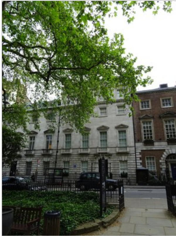
45 Berkeley Square, London