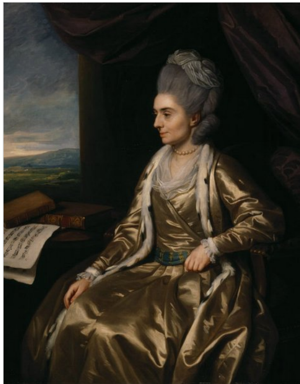
Nathaniel Dance-Holland, Portrait of Lady Clive (Powis Castle)

Margaret Clive, née Maskelyne (1735–1817) was the sister of Nevil Maskelyne (1732–1811), a clergyman and noted astronomer, who was appointed Astronomer Royal on 26 Feb 1765, just a little over two weeks before Lady Clive’s concert. Margaret’s husband was Robert Clive , the famous (or infamous) “Clive of India” (1725–1774), who was instrumental in the consolidation of British power on the Indian subcontinent, becoming wealthy in the process; he was made Baron Clive in 1762. At the beginning of June the previous year, Clive had departed for his third extended excursion to India; the original plan had been that Lady Clive would accompany him, but in the event she did not, apparently because she was pregnant (Templeton 2016, 63).