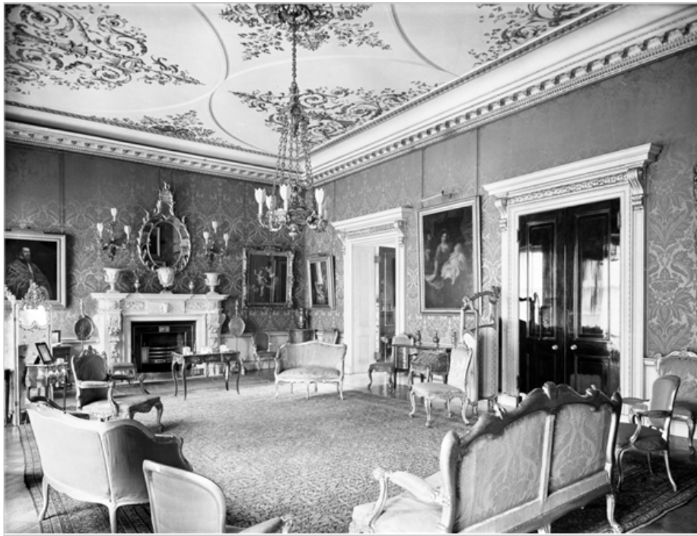
45 Berkeley Square, Great (Front) Drawing Room