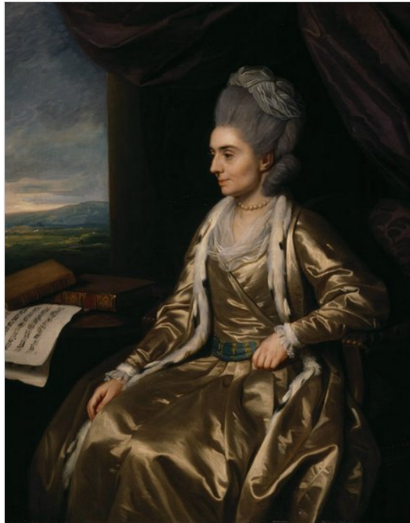
Nathaniel Dance-Holland, Portrait of Lady Clive (Powis Castle)

Margaret Clive, née Maskelyne (1735–1817) was the sister of Nevil Maskelyne (1732–1811), a clergyman and noted astronomer, who was appointed Astronomer Royal on 26 Feb 1765, just a little over two weeks before Lady Clive’s concert. Margaret’s husband was Robert Clive , the famous (or infamous) “Clive of India” (1725–1774), who was instrumental in the consolidation of British power on the Indian subcontinent, becoming wealthy in the process; he was made Baron Clive in 1762. At the beginning of June the previous year, Clive had departed for his third extended excursion to India; the original plan had been that Lady Clive would accompany him, but in the event she did not, apparently because she was pregnant (Templeton 2016, 63).