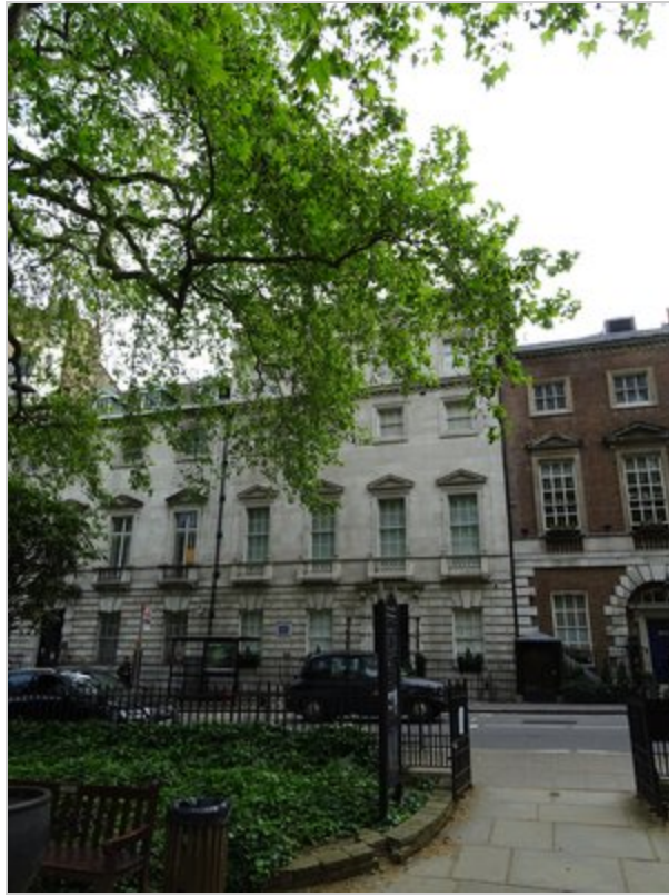
45 Berkeley Square, London