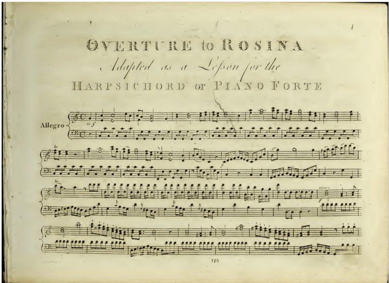
William Shield, Overture to Rosina (keyboard reduction) (IMSLP)

The overture to Rosina by William Shield (1748–1829), first performed at Covent Garden in 1782.