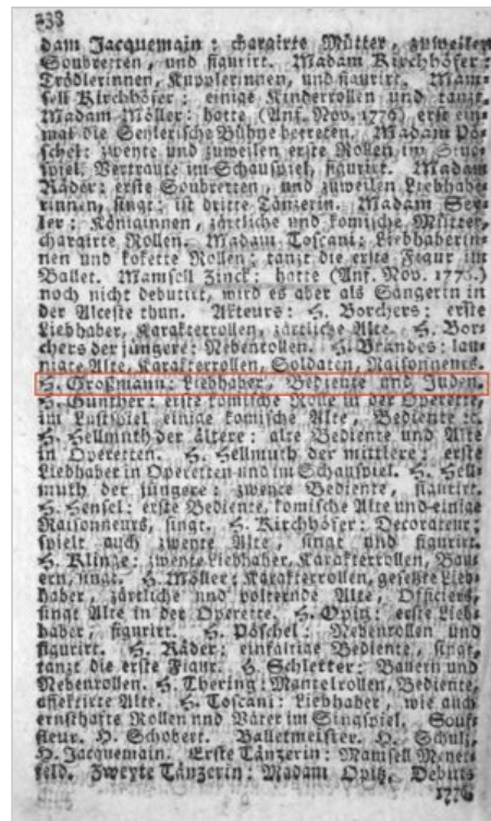
Theater=Kalender, auf das Jahr 1777, 237-39