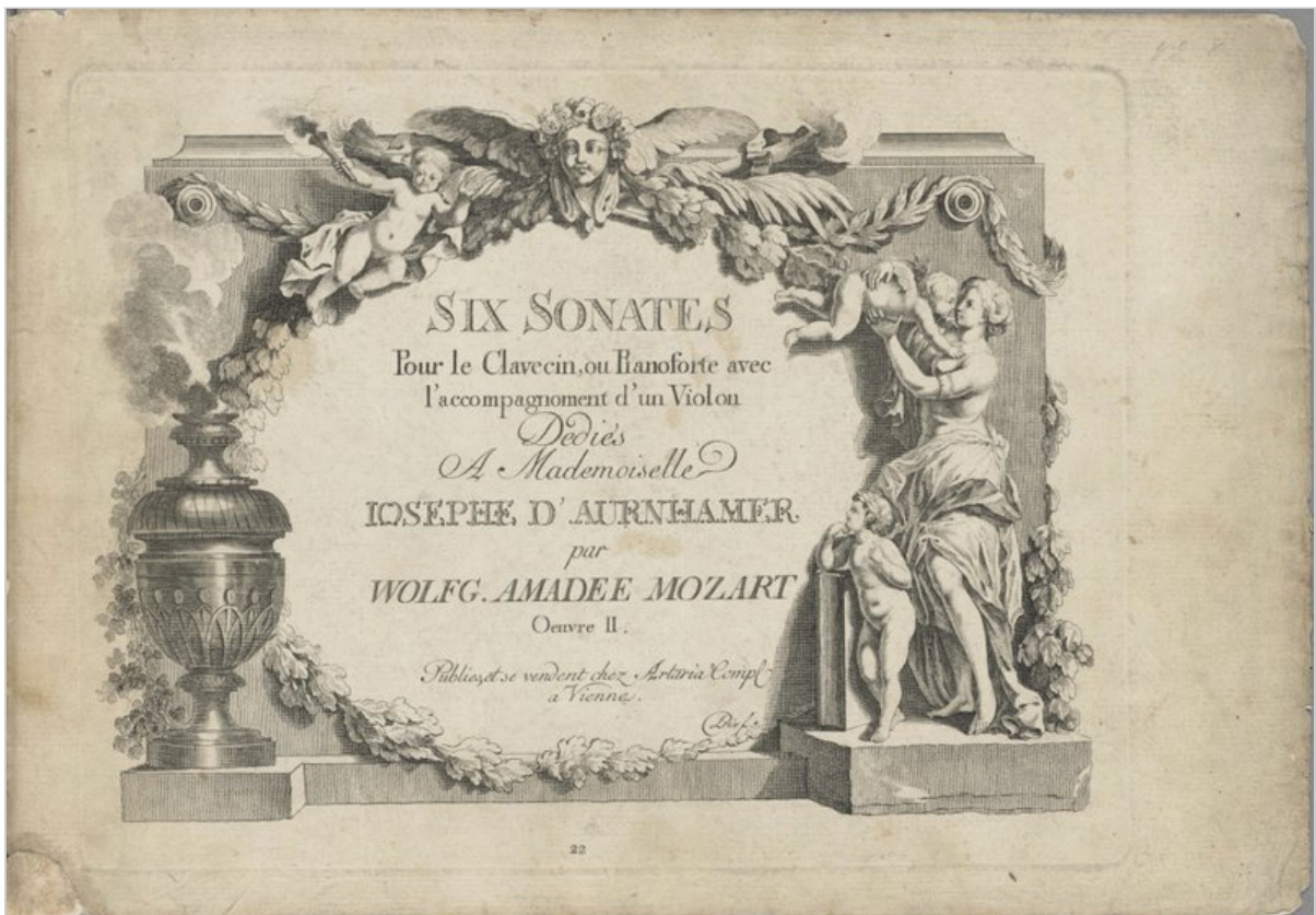
Title page of Artaria's edition of Mozart's op. 2

Little is known about the early reception and distribution of this set. Mozart wrote to his father on 24 Nov 1781 (two weeks before Artaria's advertisement): "Nun sind meine Sonaten heraus gekommen, die ich ihnen mit nächster gelegenheit übermach werde" ("Now my sonatas have