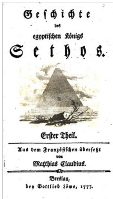
Matthias Claudius, translation of Terrasson's Sethos (1777–78) vol. 1, title page