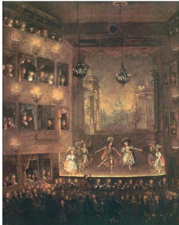
A ballet in the presence of King Stanisław August, public theater, Warsaw, 1790. Collection of the National Theater Museum, Warsaw ( Wikimedia Commons )

Performances by the German company under both Constantini and Lubomirski took place in a theater on Kraśiński Square in Warsaw built in 1779 by Franciszek Ryx (1732–1799), chamberlain to King Stanisław August Poniatowski (Stanisław II August, 1732–1798, reigned 1764–1795), to whom the performance of Entführung on 8 May 1783 was dedicated. The theater later became known as the National Theater (Teatr Narodowy), but had not yet been given that name in 1783.