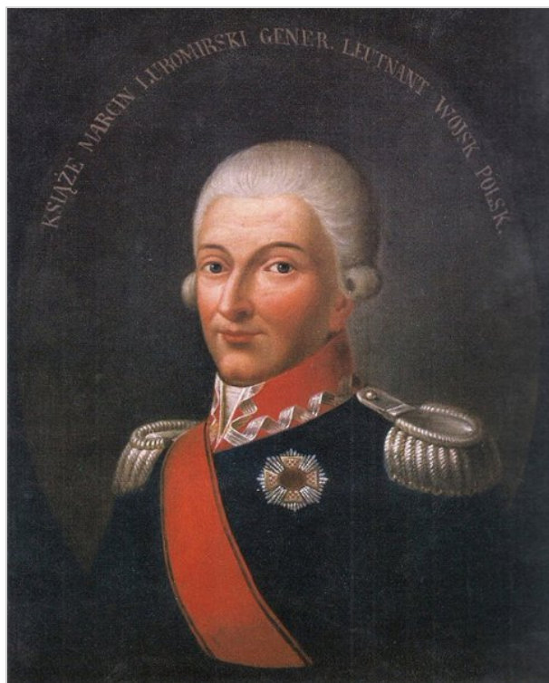
Jerzy Marcin Lubomirski, Muzeum Okręgowe w Rzeszowie ( Wikimedia Commons )

That Jerzy Marcin Lubomirski is hardly ever mentioned in the official contemporary papers and the later historical studies is due not only to the relatively insignificant part he played in eighteenth-century cultural activities (he performed the role of the entrepreneur of the Warsaw public theater for only a short time in 1783 and 1785), but, surely, also to his morally offensive lifestyle. Officially appointed General of the Army of the Kingdom of Poland, his contemporaries knew him better as a plunderer, a bandit, a man who had even been condemned for murder, and a sexual pervert. In short, he was a man who did not abide by any law or social convention, and could afford to live in such a manner only because he belonged to the nation's most wealthy nobility.