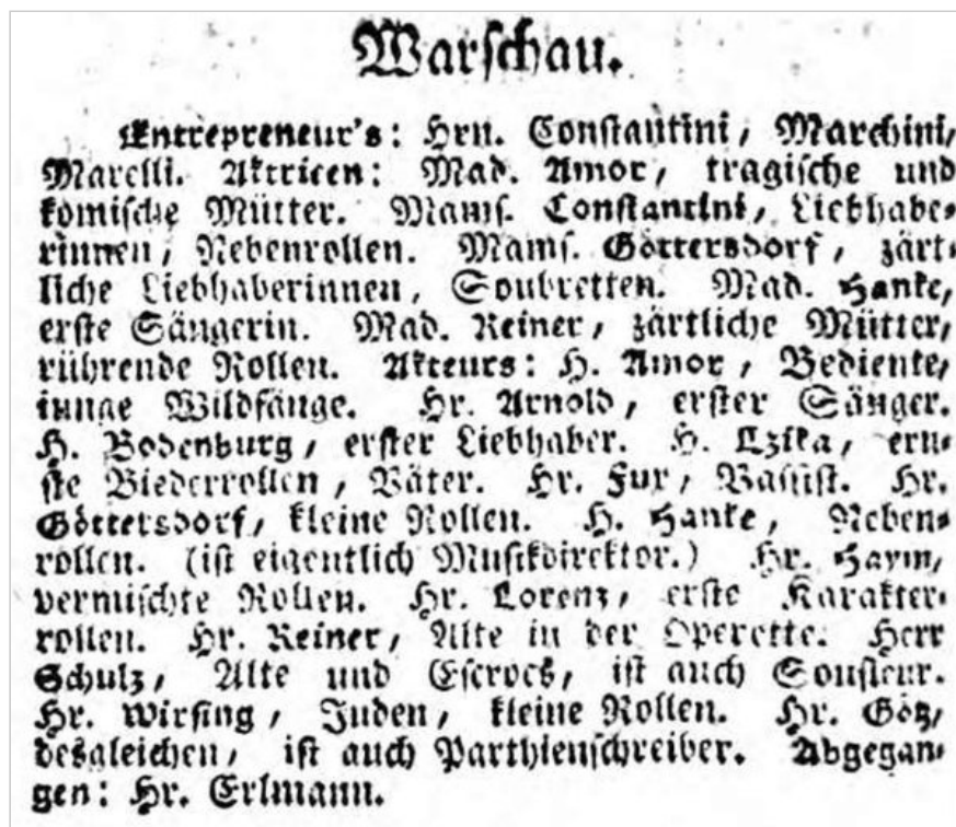
Roster of the German Company in Warsaw in 1782.