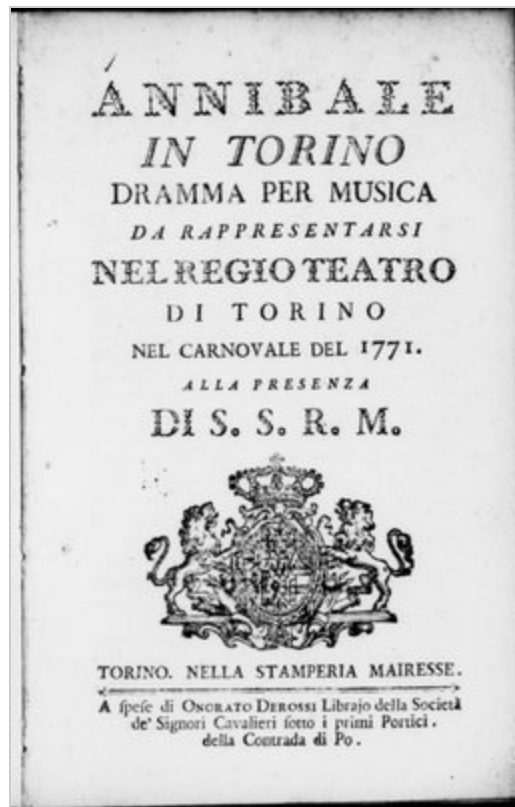
Title page of L'Annibale in Torino (Turin 1771)