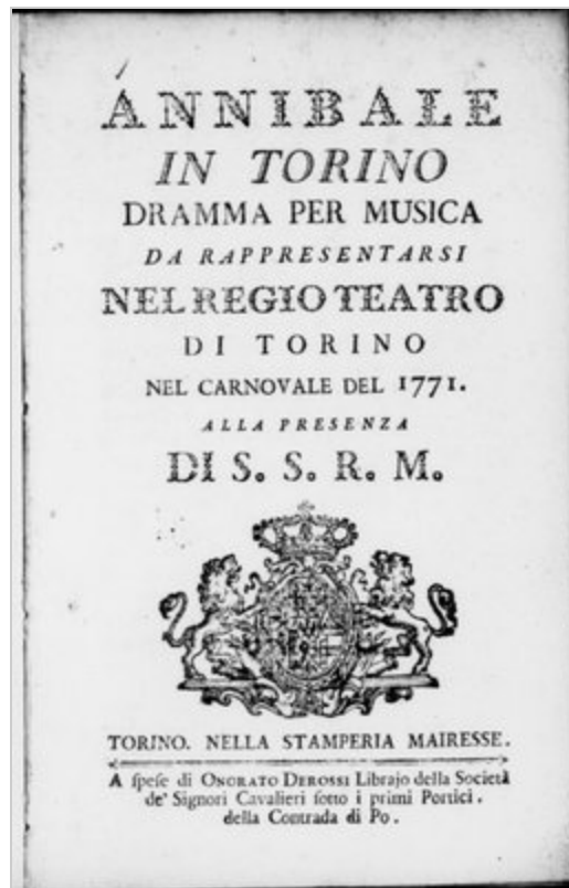
Title page of L'Annibale in Torino (Turin 1771)